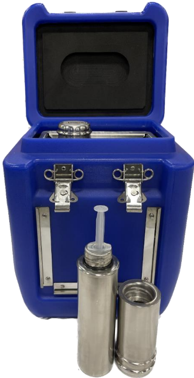
Figure 2: Unit Dose Case - Open with One UDS Inside