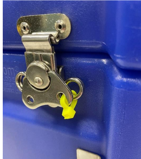
Figure 5: Zip Tie Seal Tightened to Prevent Rotation of the Latch Handle