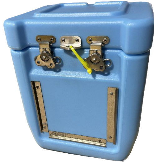
Figure 7: Zip Tie Seal Tightened to Prevent Rotation of the Latch Handle