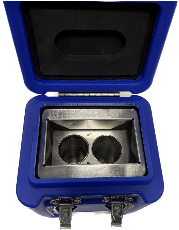
Figure 3: Unit Dose Case, Cylindrical Cavities. Greater Shielding on Left Side (RSS Max Unit Dose Shield) only