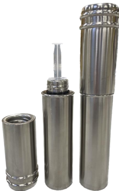
Figure 1: UDS Top, UDS Bottom with O-Ring and Syringe, UDS Complete - Closed

NOTE: Seal may be optional when shipping in a sealed cargo compartment of a closed transport vehicle in exclusive use. Refer to applicable regulatory requirements.