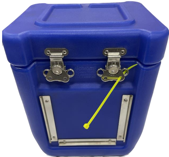
Figure 4: Unit Dose Case - Closed with Latches Locked. Zip Tie Seal Fed Through Spring and Hole in Latch Handle