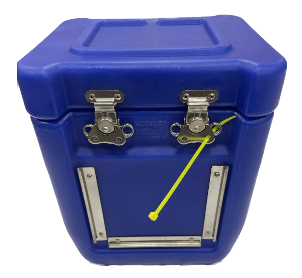
Figure 3: Vial Shield Case - Closed with Latches Locked. Zip Tie Seal Fed Through Spring and Hole in Latch Handle