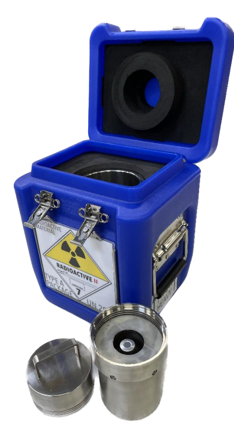
Figure 1: Vial Shield Top, Vial Shield Bottom with Rubber Seal and Vial Inside, Vial Shield Case - Open