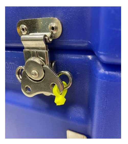
Figure 4: Zip Tie Seal Tightened to Prevent Rotation of the Latch Handle